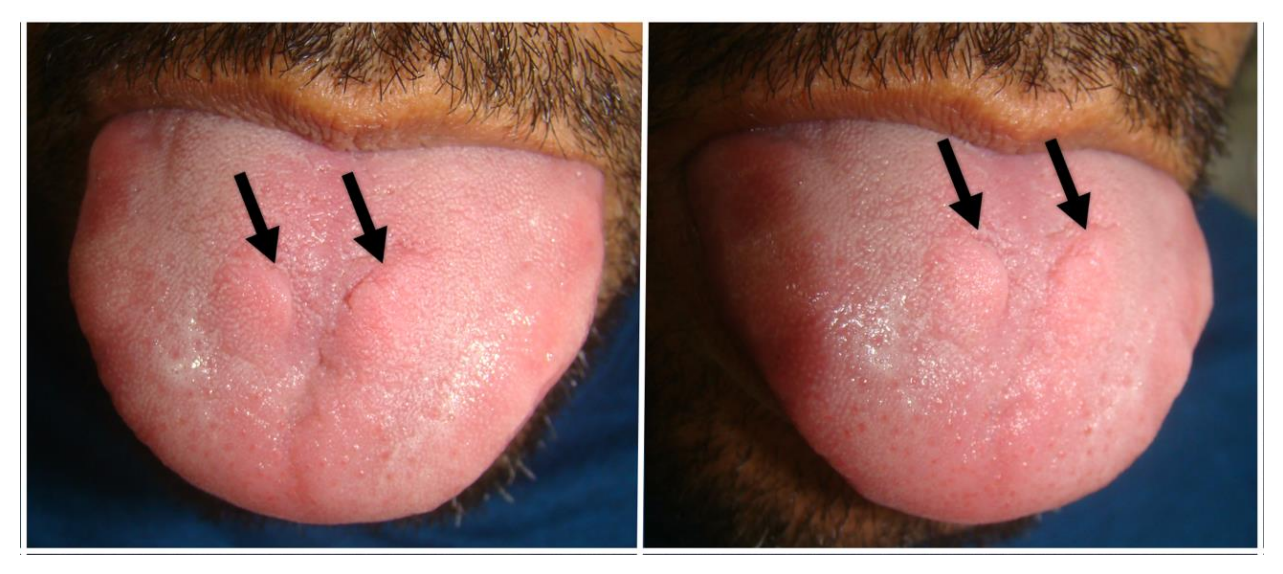
Figure 1 . Clinical appearance of the hamartomatous lesion (arrows).

Male (ASF), old, 47 years melanoderm, without systemic alterations, shows bilateral nodular injury on the dorsum of the tongue with an undetermined evolution period. The lesions present with well-defined limits, with approximately 10mm of diameter, surface and coloration similar to lingual mucosa, and firm consistency (Figure 1).